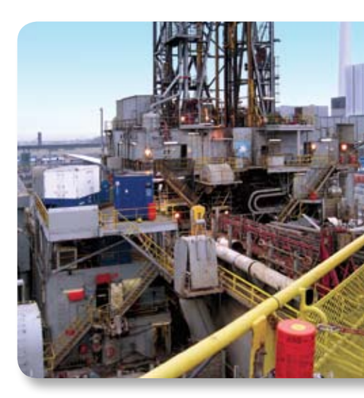
MeshGuard can be used on drilling rigs